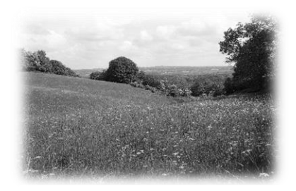
Romsley Manor Farm Meadows

Welcome to your summer newsletter. I hope you are all well and looking forward to a time when we can meet up again. There is no news about restarting our meetings at St. Saviours but I am fairly certain that our two walks, planned for later this year, can go ahead. You can find details overleaf. For now, talks will continue to be online – for details and how to book visit <a href="https://www.worcestershirewildlifetrust.co.uk/whats-on">www.worcestershirewildlifetrust.co.uk/whats-on</a>