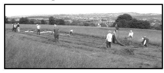
Volunteering at Penorchard Meadows in 2010

Work parties are held on Mondays 10am - 3pm on